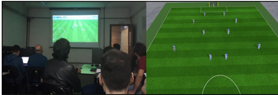
Figure 1 - Friendly match between teams A and B of 3D humanoid robot football simulator

between teams A and B of the simulator to present the project developed in the Mobile Robotics class.